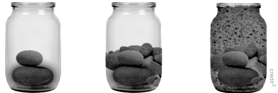
Figure 2: If you do big things first, you can fit in smaller things.

You know the geology-in-a-jar lesson from Stephen Covey: 1 Schedule big things first, otherwise you run out of time (Figure 1 & Figure 2).