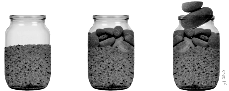
Figure 1: If you do little things first, there's no time for big things.

Three mindsets · Rocks maximize Impact · Sand maximizes Throughput · Pebbles maximize ROI · Sprint-Planning